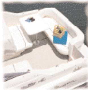
Facing aft seats and the optional table provide the perfect social setting.