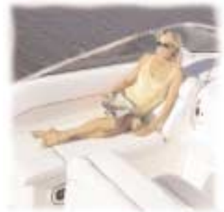
Enjoy the sun and the smooth ride as you relax on the comfortable sun lounger.