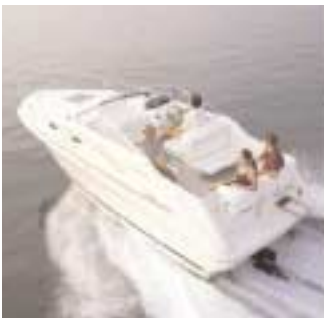
The spacious cockpit provides plenty of room for seating your family and guests, while the transom door makes boarding easy.