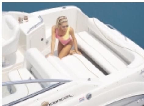
Facing aft seats allow for lots of camaraderie among passengers and converts into a sun lounger.