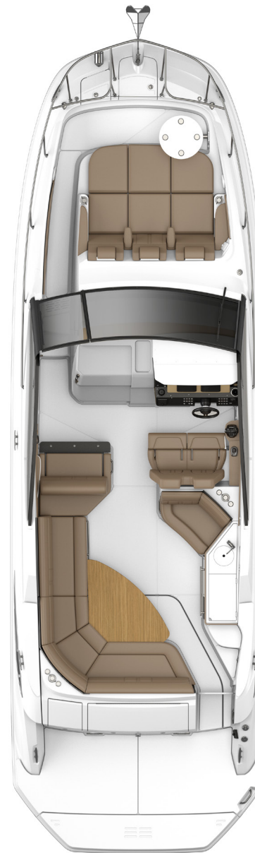
DECK / COCKPIT LAYOUT (Shown w/ Optional Equipment)

NOTE: Some features and options may not be available when a boat is built for regions outside North America and/ or has CE Certification. Boats ordered with 220V/50 cycle electrical systems will have the appropriate appliances in the corresponding voltage.